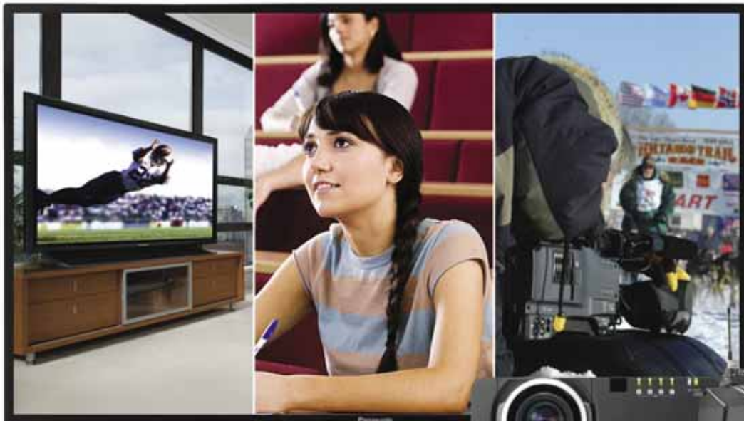
LF Series Full HD LCD