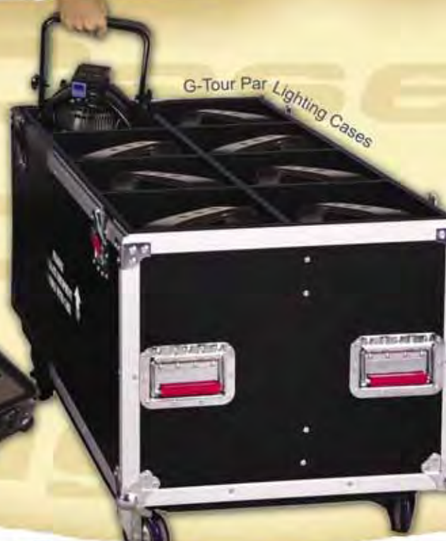
G-Tour Par Lighting Cases