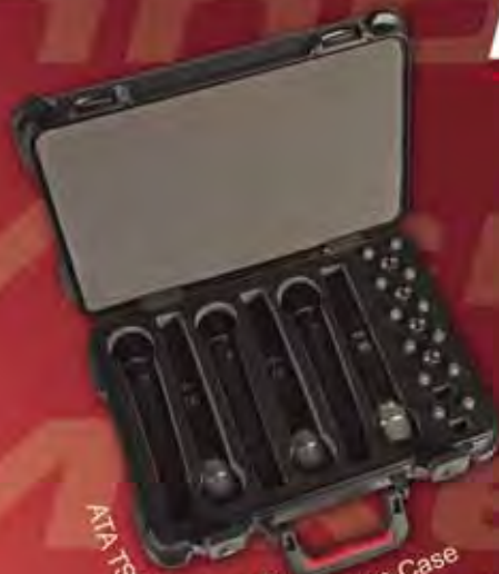
ATA TSA Wireless Microphone Case