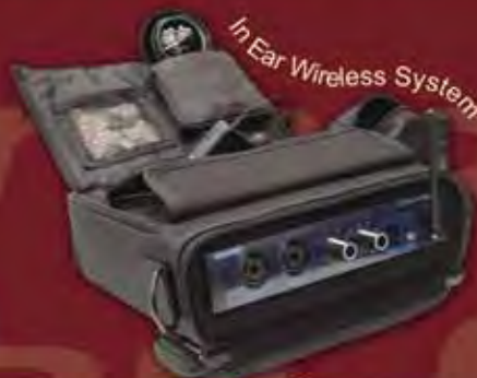
In Ear Wireless System