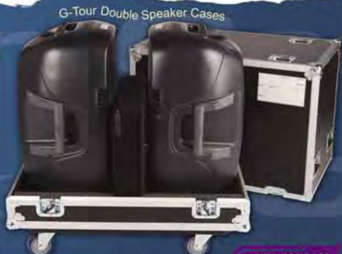
G-Tour Double Speaker Cases

Get the free mobile app for your phone http://gettag.mobi