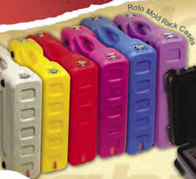
Roto Mold Rack Cases