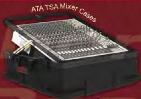
ATA TSA Mixer Cases