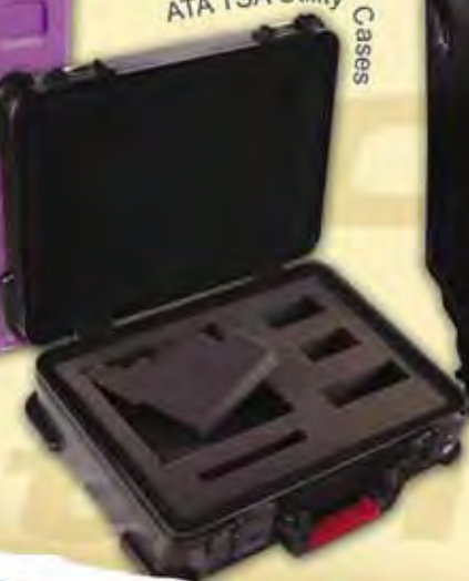
ATA TSA Utility Cases