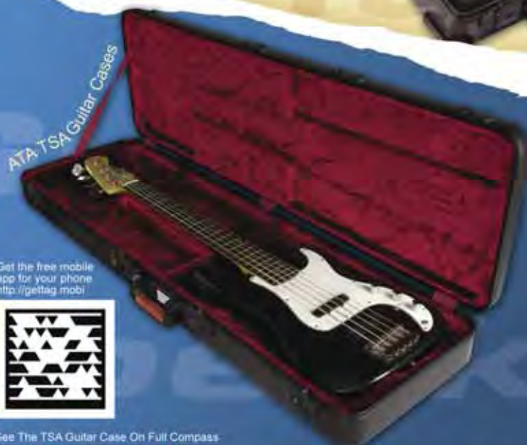
ATA TSA Guitar Cases