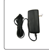
1- AC adapter