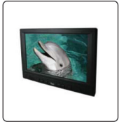
1- V9200 Monitor