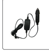
1- Car Adapter