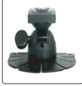
1- Table Stand