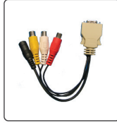
1- A/V Cable