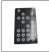
1- Remote Control