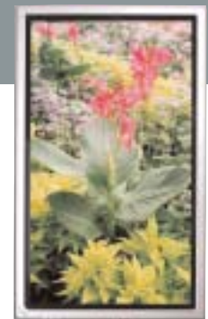
You can mount your display vertically using our PSM Series mounts