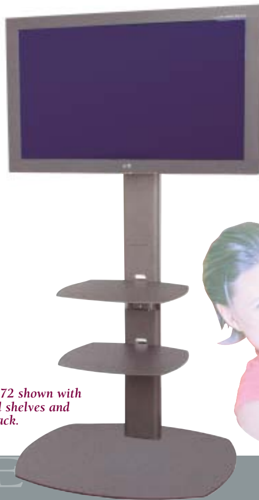
PSD-TS72 shown with optional shelves and cover pack.

When combined with a mount, our TS series floor stand allows you to place a plasma display in a horizontal or vertical position (with PSM mount only). You can adjust display height to any point along the stand's vertical poles to achieve the perfect viewing height. The display then locks into place. Available in 60", 72" and 84" heights, the poles also serve as a conduit for cabling. Stands mate with our PSM or CTM series plasma mounts, which must be added separately to complete the system. Features chrome poles. Optional shelves and cover packs are available. See pages 34-35 for details.