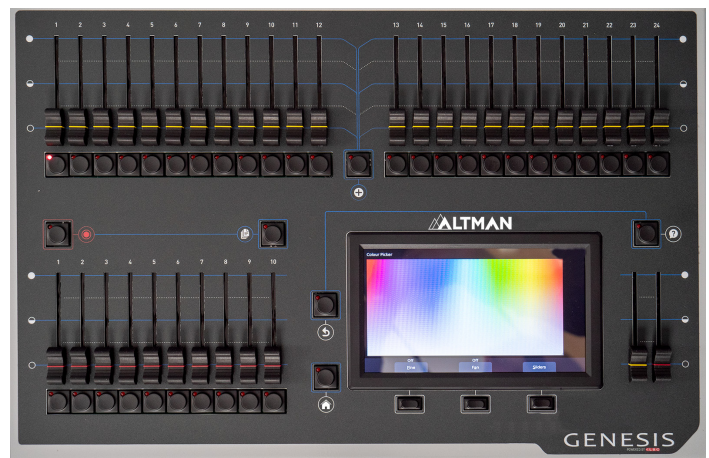
Genesis Control Console