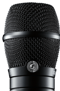
RPW192 KSM11 Wireless Vocal Microphone Capsule (Black)