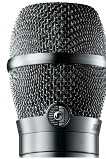
RPW194 KSM11 Wireless Vocal Microphone Capsule (Nickel)