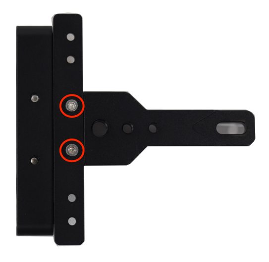
Step 2 Connect the tablet holder to the extender with the D-ring. Loosen the two rod clamps on the rod adapters.

Connect the 15mm rod monitor adapter to the tablet extender.