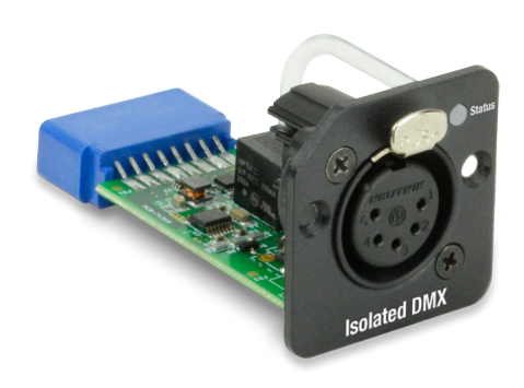
SM-DMX-X5F 5-Pin XLR Female DMX Smart Module