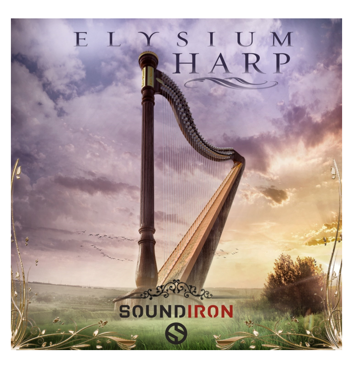
Version I.0 was released on November I, 2016