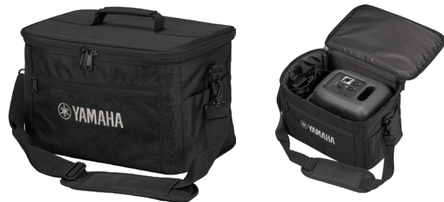
Carrying bag BAG-STR100