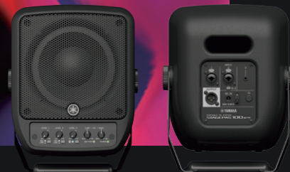
STAGEPAS 100BTR shown

Portable PA System STAGEPAS 100BTR STAGEPAS 100