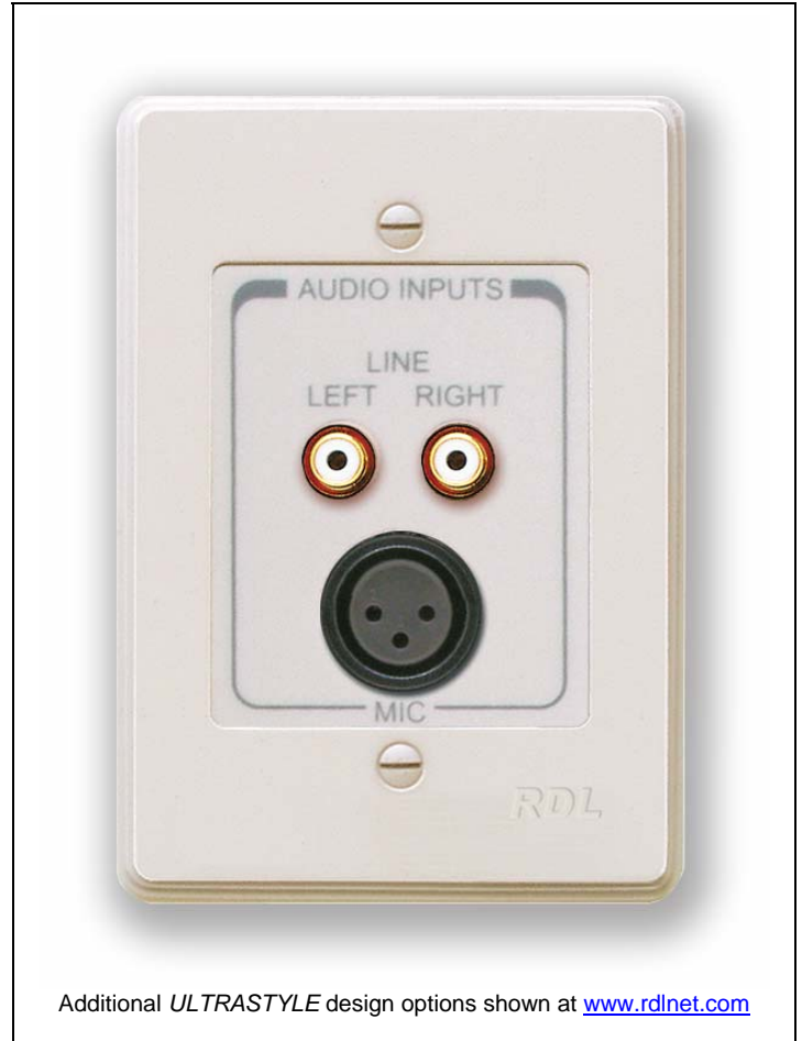
Additional ULTRASTYLE design options shown at www.rdlnet.com

Wherever style, performance, and value are required for wall or cabinet mounted audio inputs, the RCX-J1, RCX-J2 and RCX-J3 are the ideal choices. Use them individually or in conjunction with other RDL products as part of a complete audio/video system.