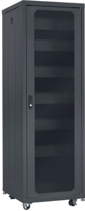
Features a clear tempered glass front door and install accessory package.