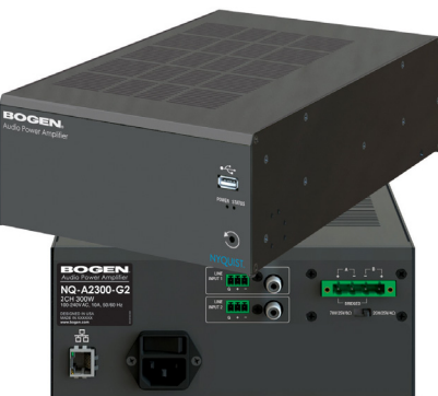
Models NO-A2060-G2 & NO-A2300-G2 shown