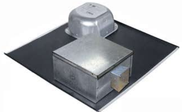
Available pre-assembled on a 2X2 Full Grill.