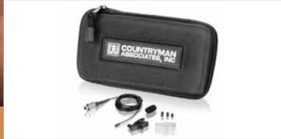
Supplied with carrying case, windscreen, cable clips, protective caps, and detachable connector (if detachable).