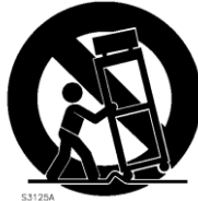
Portable Cart Warning