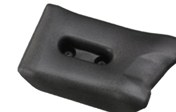
CBK-SP01 Soft shoulder pad