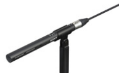
ECM-VG1 Shotgun-type electret condenser microphone