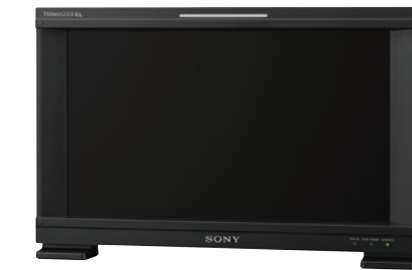
BVM-E171 TRIMASTER EL™ HD monitor HDR capable with optional BVML-HE171 HDR monitoring license