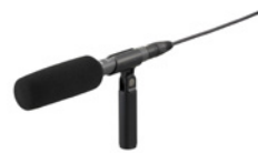
ECM-673 Short shotgun-type electret condenser microphone