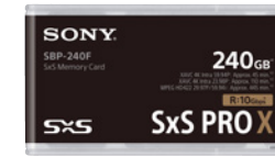
SBP-240F SxS PRO X high-speed memory card, 240GB (one GB is 1 billion bytes. A portion of the memory is used for system files and may vary)