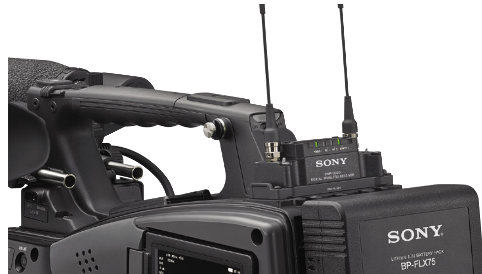
The DWR-S03D receiver integrates seamlessly with all of Sony's shoulder camcorders.