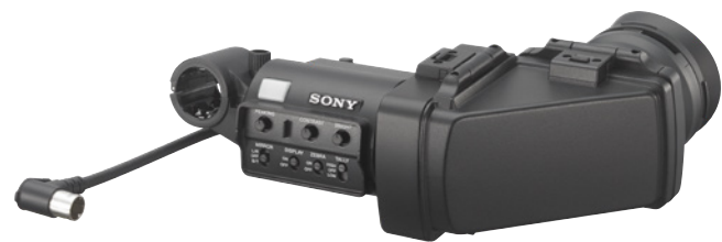
HDVF-L10 3.5-type* LCD color viewfinder

*(Viewable area measured diagonally. Sold separately.)