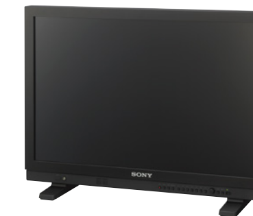
LMD-A Series Affordable HD monitors with v3.0 firmware for HDR viewing