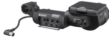
HDVF-EL30 0.7-type* Full HD OLED viewfinder with LCD monitor for viewing at a distance