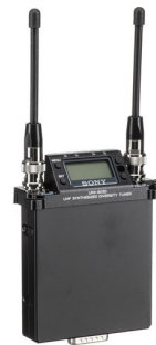
URX-S03D 2-channel digital slot-in wireless receiver compatible with Sony's UWP/UWP-D Series and 800 Series transmitters and microphones