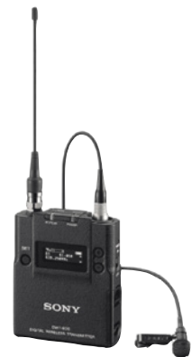
DWT-B30 Digital wireless bodypack transmitter