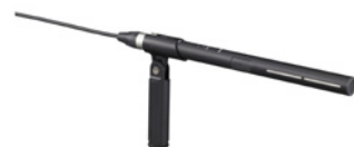
ECM-680S MS stereo shotgun-type electret condenser microphone