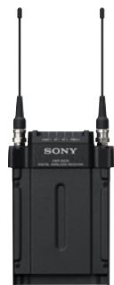
DWR-S03D 2-channel digital slot-in wireless receiver compatible with all DWX Series transmitters and microphones