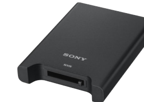
SBAC-T40 Thunderbolt® 3 high-speed SxS memory card reader/writer