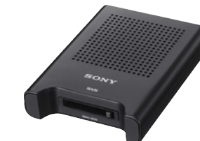
SBAC-US30 USB 3.0 high-speed SxS PRO+ and SxS-1 memory card reader/writer