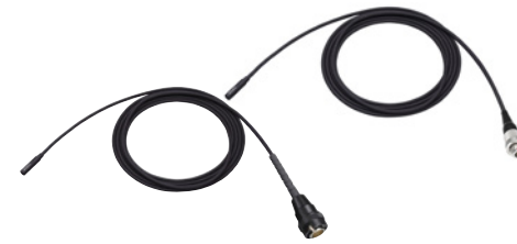
ECM-90BC/ECM-90LM Ultra-compact lavalier microphone, perfect for Sony's wireless bodypack transmitters