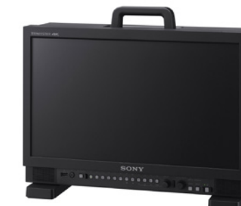
PVM-X1800 18-inch* 4K HDR TRIMASTER production monitor