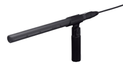
ECM-678 Shotgun-type electret condenser microphone