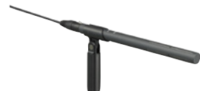
ECM-674 Shotgun-type electret condenser microphone