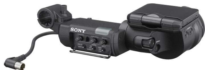
HDVF-EL30 0.7-type* Full HD OLED viewfinder with LCD monitor for viewing at a distance