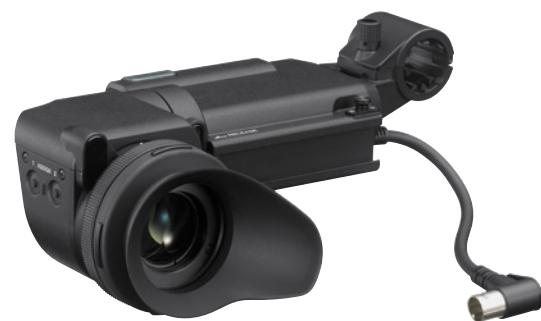
HDVF-EL20 0.7-type* Full HD OLED viewfinder

Viewfinders with a full range of features, functions and specs are available to outfit the PXW-Z750 for any application. The camcorder's LCD panel can be flipped out or rotated to almost any angle for additional monitoring flexibility. ENG-style playback and audio control buttons offer convenient, quick access and functionality, along with external controls for headphones and shutter, and D-tap power for video light. Custom user menus are included, as well as WYSIWYG paint menus and scene files for situations in which a grading workflow is not desired.