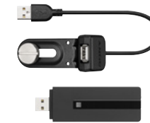
CBK-WA02 2.4GHz - 5GHz Wireless LAN adaptor