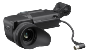
HDVF-EL20 0.7-type* Full HD OLED viewfinder