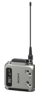
DWT-B03R Digital wireless microphone bodypack transmitter