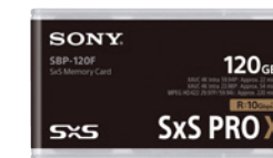
SBP-120F SxS PRO X high-speed memory card, 120GB (one GB is 1 billion bytes. A portion of the memory is used for system files and may vary)