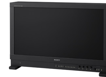
BVM-HX310 31-inch* TRIMASTER HX™ 4K HDR critical evaluation monitor