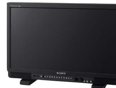
PVM-X2400 24-inch* 4K HDR TRIMASTER production monitor