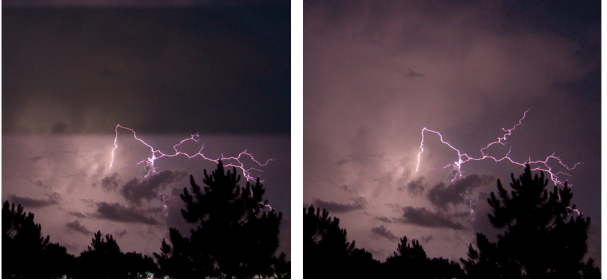
Photography and flashes can create a bright band across the frame. Global Shutter technology solves this issue. (Actual Images)

The PXW-Z750's Global Shutter technology eliminates flash-banding artifacts and distortion of fast-moving objects associated with rolling shutter sensors, allowing you to shoot with confidence on the red carpet, or when LED lighting and other uncertain lighting conditions are present.