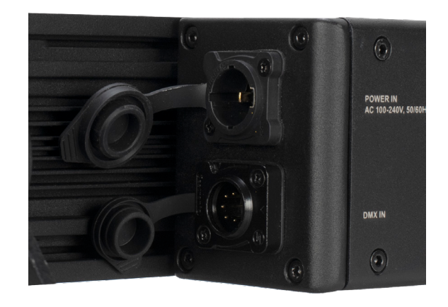
IP Rated rubber covers protect In/Out Locking Power connectors and IP rated 5-pin sockets