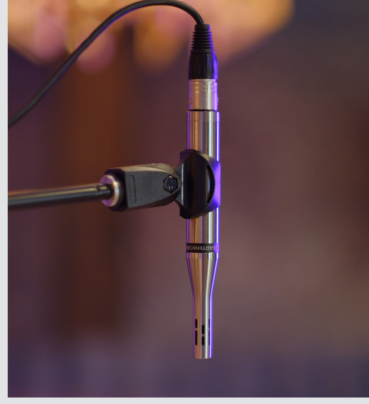
SR25 (STEREO PAIR) CARDIOID MICROPHONES FOR DRUM OVERHEADS