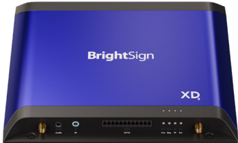
Standard I/O Package