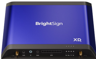
Expanded I/O Package