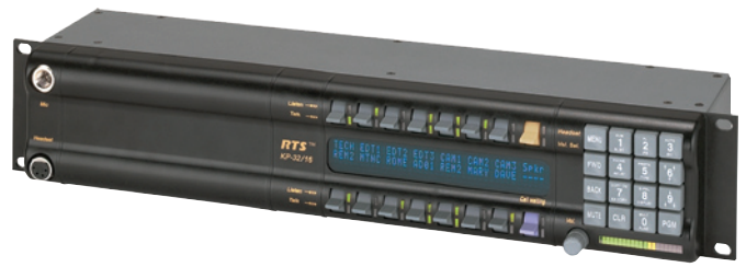
KP-32/16 16-Position Keypanel