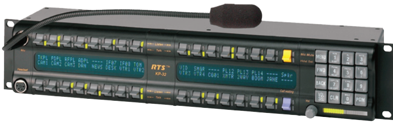
KP-32 32-Position Keypanel