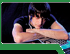
Shiny Toy Guns

The Fantom-G does most everything you want to do. You don't need a laptop, you don't need a recording interface, or plug-ins. This is a computer and recording system inside a keyboard, but with less confusion. It's everything, and simple.