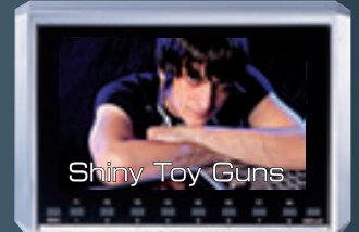
Shiny Toy Guns