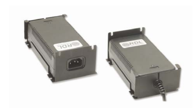
FP-PSB1 Power Supply Bracket with PS-24U2 mounted

The FP-PSB1 mounts to any flat surface or in an RDL Flat-Pak series rack mount panel (FP-RRA or FP-RRAH). The design of the FP-PSB1 allows it to slide into the Flat-Pak rack mount track. Mounting the FP-PA20 power amplifier (or other RDL modules using available adapter) together with the power supply conserves rack space and produces a convenient and professional installation.