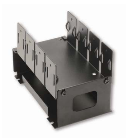
FP-PSB1 Power Supply Bracket with PS-24U2 mounted