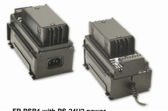
FP-PSB1 with PS-24U2 power supply and FP-PA20 audio amplifier mounted