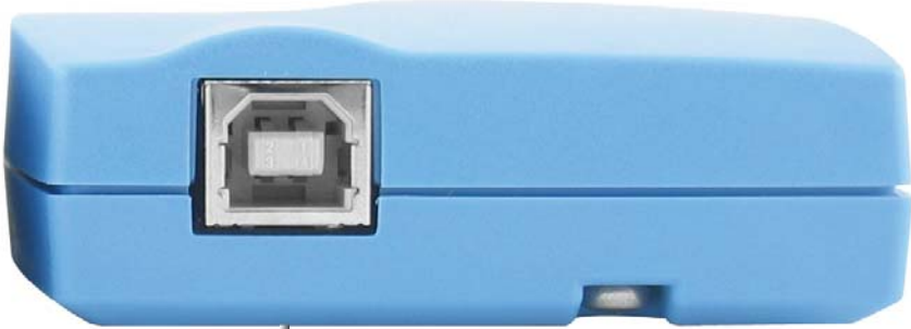
USB In from computer