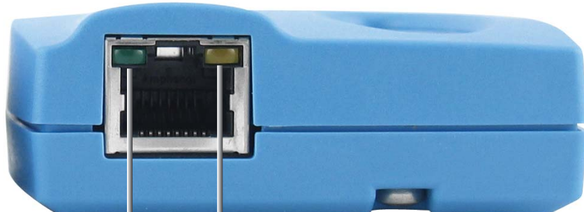
Device LED (green) Link LED (yellow)