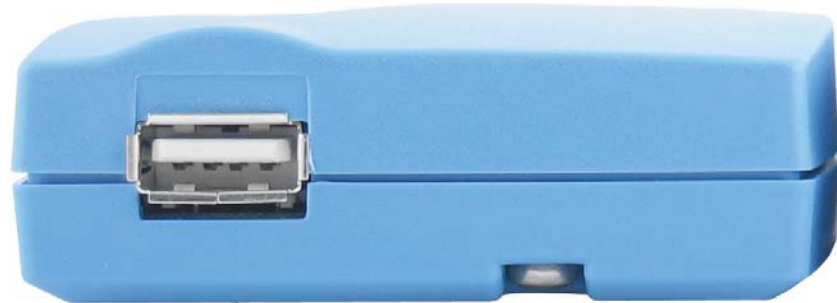
1 port USB Hub connects to USB devices