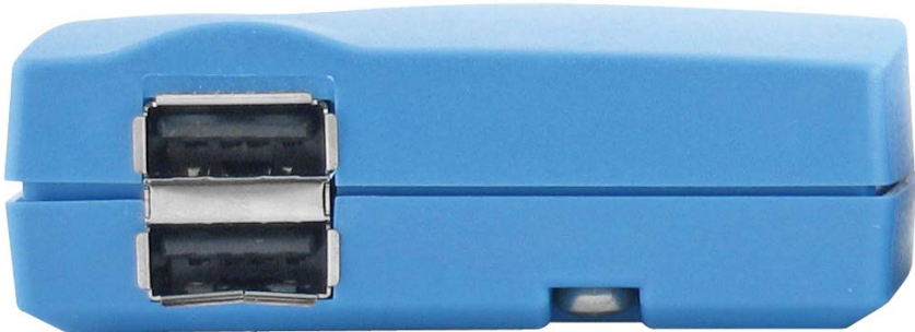
2 port USB Hub connects to USB devices