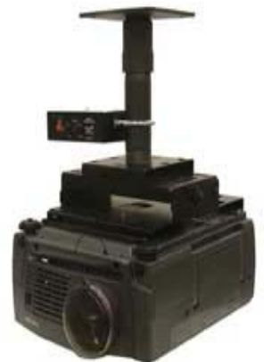
Amplifier shown mounted on the Projector's Pole