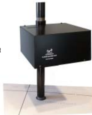
Plenum Equipment Box Allows all the Equipment to be concealed in the Plenum or Ceiling Space

2 70/25v Custom Autoformers (Built In) For Superior Performance