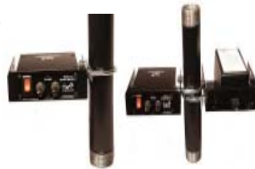
The Universal Mounting Bracket can be used in Single or in Space Saving Paired Configurations