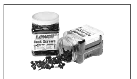
RSP-500 / RS-500 Jars