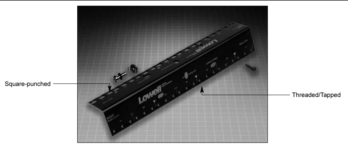
Unique 2-side Rail System