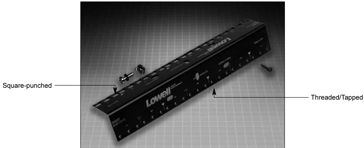
Unique 2-side Rail System