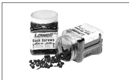
RSP-500 / RS-500 Jars

NEW RSR Robertson square head available!