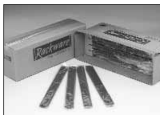
Bulk quantity models "Contractor Cartons" for large jobs and distribution