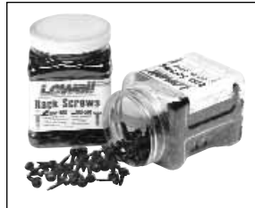
RSP-500 / RS-500 Jars

ALL screws have 5.1 hardness and include PilotPoint™ tip and captive washer!