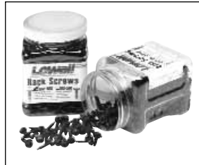
RSP-500 / RS-500 Jars

ALL screws have 5.1 hardness and include PilotPoint™ tip and captive washer!