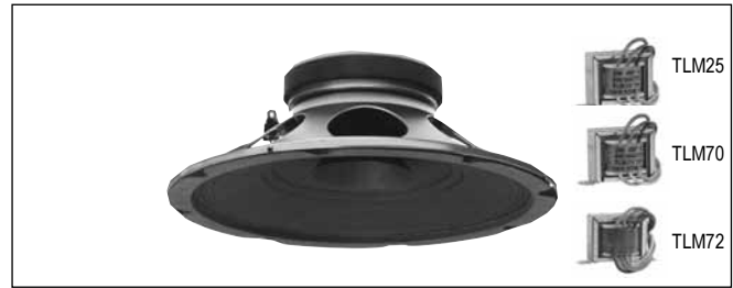
15 Watt Dual Cone Speaker Assembly with transformer (arrives factory mounted to one of four grilles below)