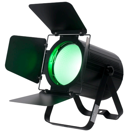
BAR001 - COB Cannon Wash Barn Doors sold separately