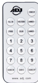
UC IR Wireless Remote Included