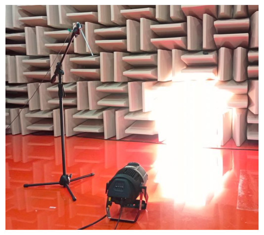
Figure 1: Test setup

The product was placed indoors in a semi-anechoic room in the internal Lab of Harman Technology in Shenzhen, China (See Figure 1). The ceiling and walls were all acoustically absorbent, and the floor was reflective. The main dimensions of the room were 5.9m * 4.9m * 3.3m (length * width * height).