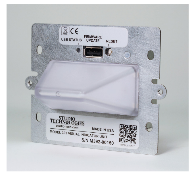
Figure 1. Model 392 Visual Indicator Unit front view

In addition to responding to intercom beltpack call requests, the Model 392 can also be used in other