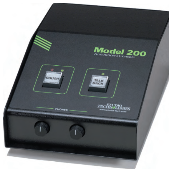
Model 200 front panel shown with buttons labeled for on-air applications

The Model 200 is optimized to directly interface into the broadcast environments typically used for events such as football, baseball, basketball, and motor sports. Standard connectors are used for the microphone, headphone, talkback, and IFB signals. This allows setup to be fast and consistent. A limited number of configuration options are provided. Once selected, no event-to-event configuration changes should be required. For ease of use, the on-air talent is presented with a simple set of controls and indicators. Whether it's mic preamplifier, audio switching, talkback output, or headphone cue feed, excellent audio performance is maintained throughout.