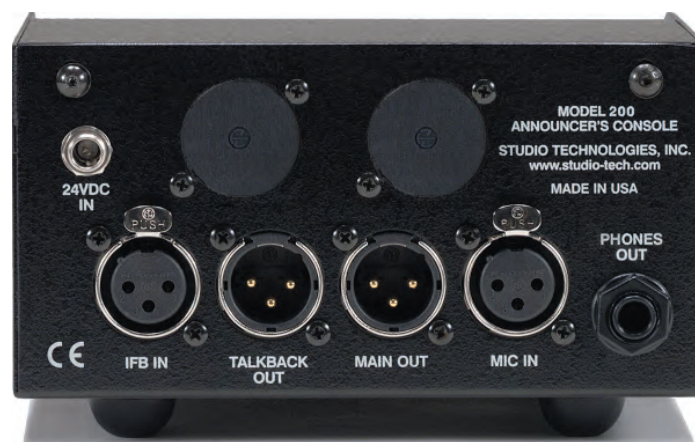
Model 200 back panel

In the world of broadcast audio it's fair to say that applications vary widely. To this end, one or two additional XLR-type connectors can be easily mounted into the Model 200's back panel. Seven 3-position "headers" are located on the Model 200's circuit board and provide technician-access to all input and output connections. Using a factory-available interface cable kit, these allow a Model 200 to be optimized to meet the exact needs of specific applications. For example, some applications may prefer to use a multi-pin XLR-type connector to interface with a headset. This could be easily accomplished by adding the appropriate 5-, 6-, or 7-pin XLR-type connector and making a few simple connections. Other applications may benefit from having "mult" or "loop-through" connections,