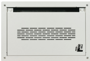
Optional cover panel