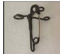
PIN-11 Safety Pin