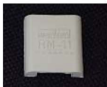
RM-11 Rubber Mount beige