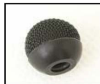
WSL-11 Large Metal Windscreen Black only