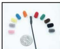
FW-11 Foam Windscreen (11 colors in 1 pack)