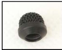
WS-11-** Metal Windscreen