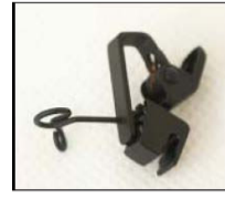
HC-11V-** Holder Clip / Vertical