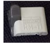
RM-11C Rubber Mount with holder clip/beige only