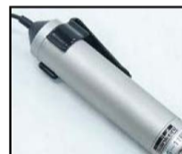
BELTCLIP for COS-11BP Belt clip parts for COS-11BP

Product features and specifications are subject to change without notice