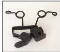
HC-11W-** Holder Clip Double for 2 COS-11