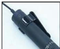
BELTCLIP for COS-11 Belt clip parts for COS-11