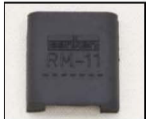
RM-11-BK Rubber Mount black