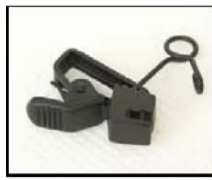
HC-11-** Holder Clip