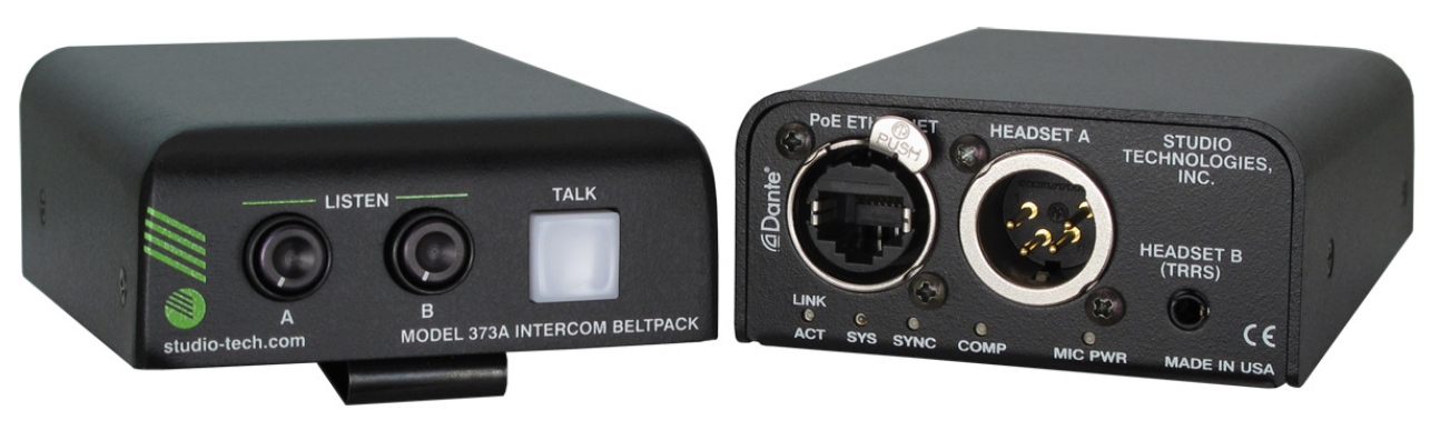
Figure 1. Model 373A Intercom Beltpack top and bottom views

Setting up and configuring a Model 373A is simple. An etherCON® RJ45 receptacle is used to interconnect with a standard twisted-pair Ethernet port associated with a local-area network (LAN). This connection provides both power and bidirectional digital audio. The Model 373A is compatible with both broadcast and "gaming" headsets.