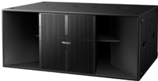
XY-218HS Dual 18-inch horn-loaded subwoofer