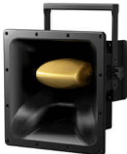
XY-2 High powered speaker