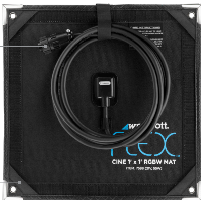
Flex Cine 1' x 1' RGBW Mat