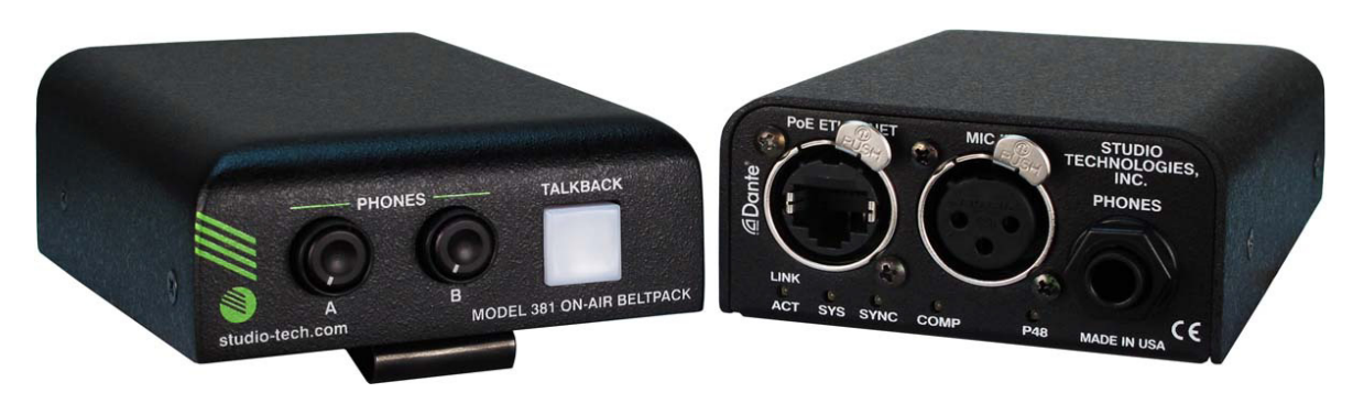
Figure 1. Model 381 On-Air Beltpack top and bottom views

The Model 381 provides an "all-Dante" solution for one on-air talent location. Two Dante audio input channels supply the user with their talent cue (IFB) signals. Should the cue signal be "mix-minus" an integrated sidetone function can provide the user with a microphone confidence signal. Two Dante audio output channels, one designated as main (for "on-air" use) and the other talkback, are routed via the associated local-area network (LAN) to inputs on Dante-compatible devices. A pushbutton switch, located on the Model 381's top panel, provides a combination talkback and "cough" function. Five configuration choices allow the exact action of the talkback button and associated function to be selected. Choices include whether or not the Dante main output channel is muted when talkback is active as well as offering the ability to disable the button. The audio switching is performed in the digital domain and is virtually "click-free."