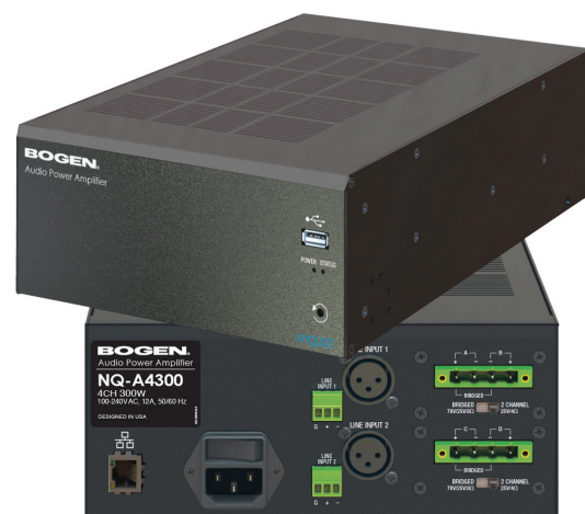
Model NQ-A4300 shown