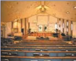
Houses of Worship