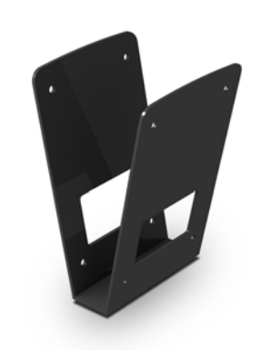
MASKCV-BL V-shaped 2-way cluster bracket for MASK4C(T)-BL/MASK6C (T)-BL