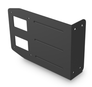
MASKCL-BL L-shaped side bracket for MASK4C(T)-BL / MASK6C(T)-BL