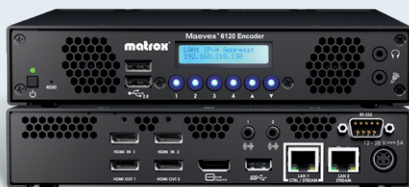
Matrox Maevox 6120 dual 4K encoder appliance (front & back view)

The Maevox 6100 Series is available as system-independent, standalone encoder appliances (Maevox 6150 quad and 6120 dual), as well as a single-slot, high-density PCIe x8 quad encoder card (Maevox 6100).