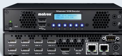
Matrox Maevox 6150 quad 4K encoder appliance (front & back view)