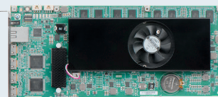
Matrox Maevox 6100 quad 4K PCIe encoder card