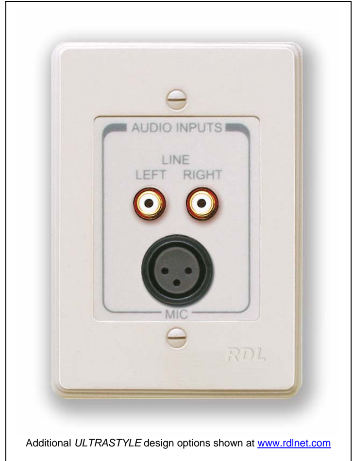
Additional ULTRASTYLE design options shown at www.rdlnet.com

Wherever style, performance, and value are required for wall or cabinet mounted audio inputs, the RCX-J1, RCX-J2 and RCX-J3 are the ideal choices. Use them individually or in conjunction with other RDL products as part of a complete audio/video system.