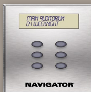
NAVRC-100 Wall Panel Remote