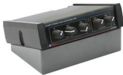
EZ-DC2 WITH AN EZ PRODUCT MOUNTED

Mount the EZ product to the chassis using two screws.