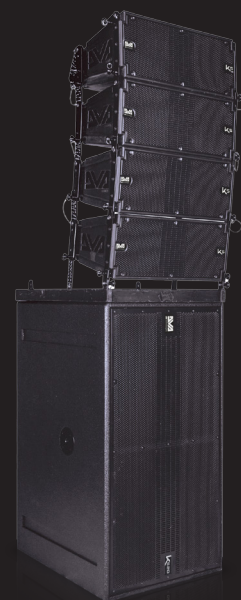
DVA K5 groundstacked with DVA KS20