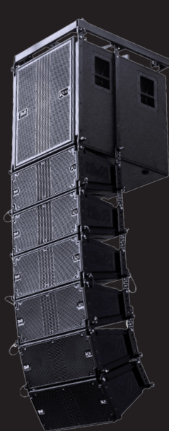
DVA K5 flown with DVA KS10

DVA KS20 is the perfect low-end complement for larger DVA K5 systems and can also be used vertically for groundstacked configurations thanks to the DRK-20/10 pick points on top.