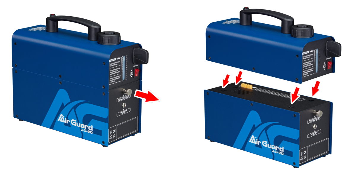
Step3: Connect the battery base or power base to the fog machine. Turn on the machine to start operation.