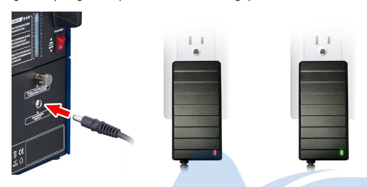
Plug in the charger

When the LED indicator on the charger turns red, the battery is being charged. When it turns green, the charging process is completed. A low power battery requires approximately 3 hours to be fully charged. A fully charged battery can run the machine for roughly 12 minutes.