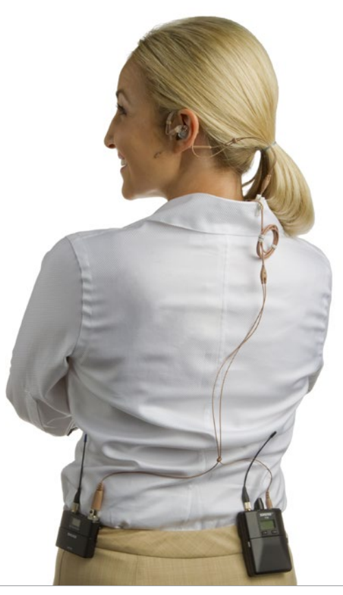
Countryman Earsets, Shure Earphones, transmitter and receiver sold separately. Supplied with protective case.

Detach the earset or earphone instantly using snap-on connectors. Use the miniature cable clips, slider, and collar clips to customize the fit to be both comfortable and discreet.